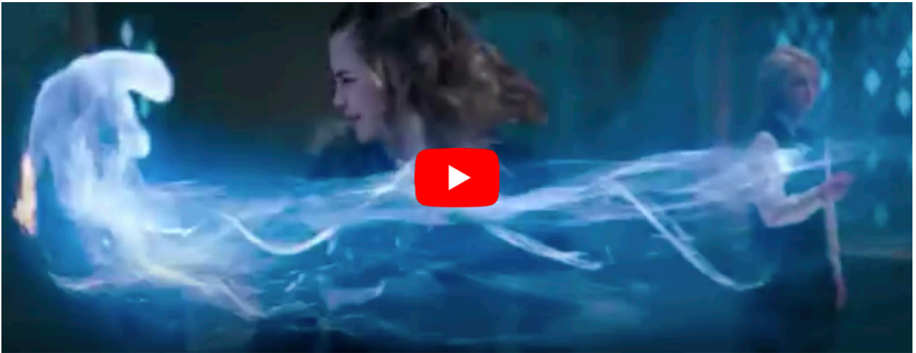
Harry Potter and the Order of the Phoenix - Patronus Practice